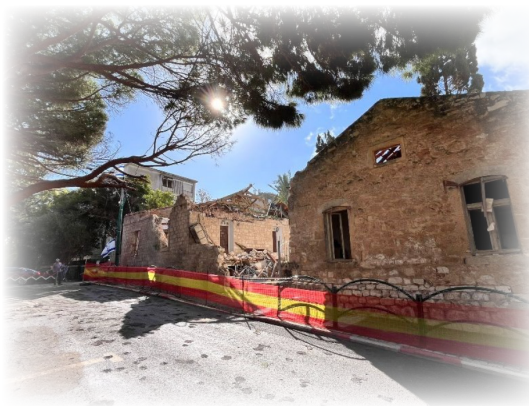
The destruction at the synagogue where the missile struck in Haifa on 16th November

Through it all, we continue to hold fast to the Rock of Ages, knowing that while everything may shake and move, He is forever the same—stable, firm, unshakable, and immovable.