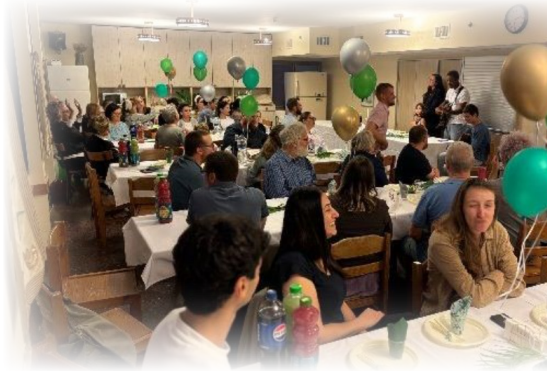
A Rectifying Shabbat Meal

We recently held two worship nights—one at the end of October for the entire community and another in mid-November for the youth of the greater Haifa region. Unfortunately, on the evening of the first event, a hostile drone warning was issued across the area for an hour beforehand, which deterred many from travelling. However, those who attended enjoyed basking in the Lord's presence and lifting up our nation in prayer during this time of war. The second evening was particularly special, as we hosted around 80 youth representing over a dozen congregations from all over Haifa and from Netanya in the south to Karmiel in the north. They came together to praise and worship the Lord. Our aim is to help the youth in the area form bonds, as many attend the same schools but are unaware of one another. The evening was full of fun and God's presence, and we received excellent feedback that the youth were deeply blessed.