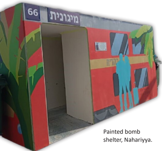
Painted bomb shelter, Nahariyya.

The mayor of Nahariyya had shelters placed on the streets. Some of them were painted, like this one near the train station.